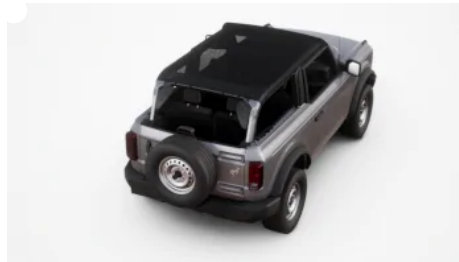
Top, Soft Mesh (Bimini) - Throw-In, Two-Door